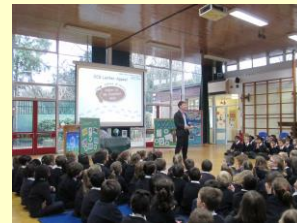
Catholic Children's Society (Westminster) Making A Difference

Monday 1st February the children heard a speaker from the Catholic Children's Society at our Gospel Assembly. They listened to how the money raised through the Lenten boxes helps those in need throughout the world.