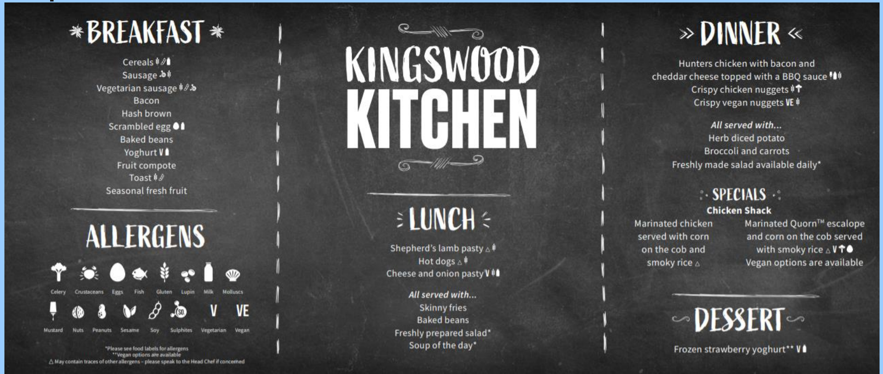
Example of menu